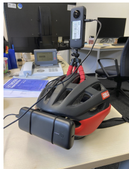
Figure 3. Experimental Device.