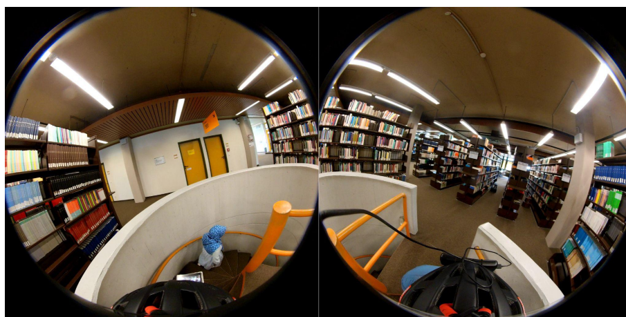
Figure 2. Example of A Raw Data Frame.

Our case study at the University of Augsburg campus focused on the complex wayfinding within building D, which provides access to facilities like the cafeteria and library. Using an Insta360 ONE X2 camera, we captured 360-degree video footage to annotate visible indoor landmarks. Potential test subjects recorded frame numbers/IDs and pixel coordinates for reference. Two example frames of raw data are visualised in Figure 2 .