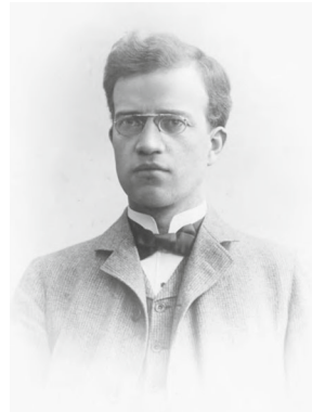
Fig. 1 Edvard Phragmén