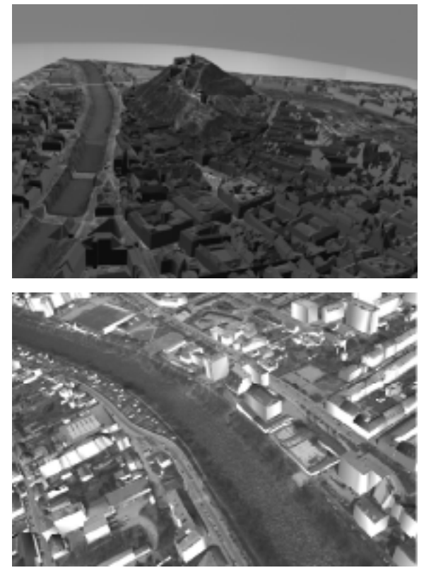
Fig. 4 - Examples from the VRVIS Model (K Karner)

The project deals with the creation of a photorealistic 3D city model from existing 2 1/2 dimensional GIS data provided by the Municipality. The input data consists of roof lines, a 30m grid DEM (digital elevation model including break lines) and registered aerial images (for texturing) (figure 4).