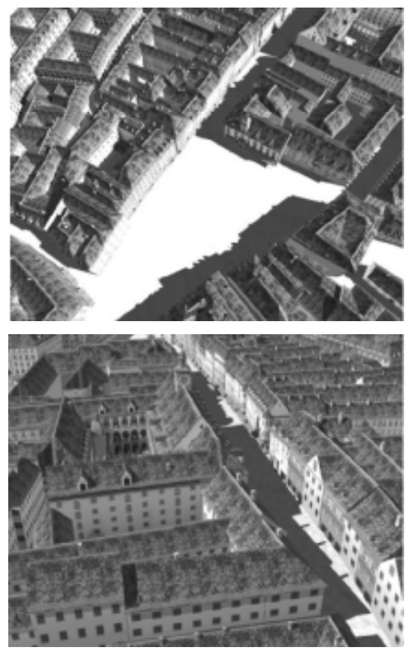
Fig. 3 - Renderings from the animation of Graz 17th century (G.Angerer – Sense2)

The most important thing was the decision of the municipality to invest in a 3D city model. The department of survey at the municipality started with several attempts to establish an automatically created city model out of their data sources. Even the "Digcity" project at Graz university of Technology started in the beginning with the intention to base our work on this 3D model and using our resources (mainly student's workforce) to refine this automatically created city model. But in the beginning all the attempts of the municipality failed and we found out that for our project it was even better to start with the basic data itself then to try to erase the mistakes of these early generated models. These experiences also forced the city of Graz to increase the quality of their basic data sets. Because of the facts that the old city of Graz is listed by the UNESCO as a World Heritage and will be Cultural Capital of Europe in 2003 there was the possibility for the city to spend some money on the project.