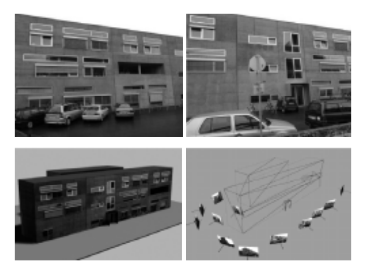
Fig. 5 - Examples from the VRVIS Model (Bauer)

A method to automatically calculate texture maps for a given 3dimensional object out of a sequence of images. This is an interesting aspect for the creation of the textures for a city model. Very often it is not possible to make photos of a building without elements in the foreground (e.g. persons, vehicles, vegetation) which block the view and have to be removed from the texture when it's used for the building (figure 5).