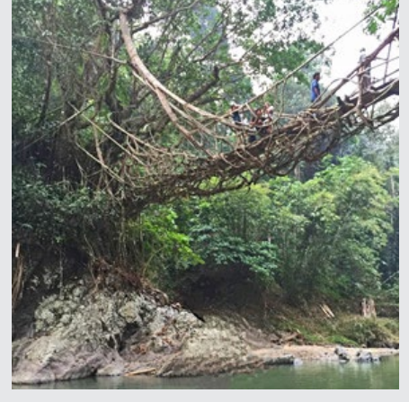
(f) Living root bridge (July 2015, Kanekes, Java, Indonesia)<sup>1</sup>.

Figure 1: Cells and tissues from various organisms are utilised as the living component for ELMs. Examples of the different main categories using bacteria (a), algae (b), the principles of nacre (c), synthetic biology (e), mycelium of fungi (d) and plants (f) showcase the broad spectrum of living entities serving as foundational elements in developing innovative ELM technologies