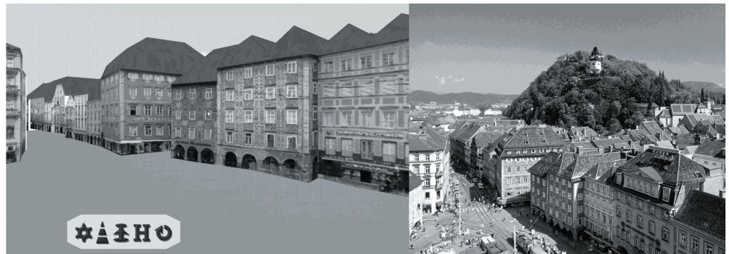
Figure 4 Graz: Main square (Hauptplatz) - screenshot vs. reality.