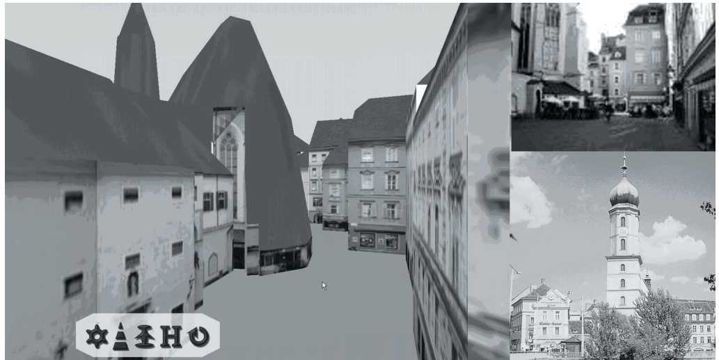
Figure 3 Graz: Screenshot from the VRML model vs. the “real world”.

Opening the crude VRML models (which includes photorealistic textures) to public access can only be explained with certain pressures of “having to show results” and does not really explore and transport the idea of a city model as elaborated in this paper.