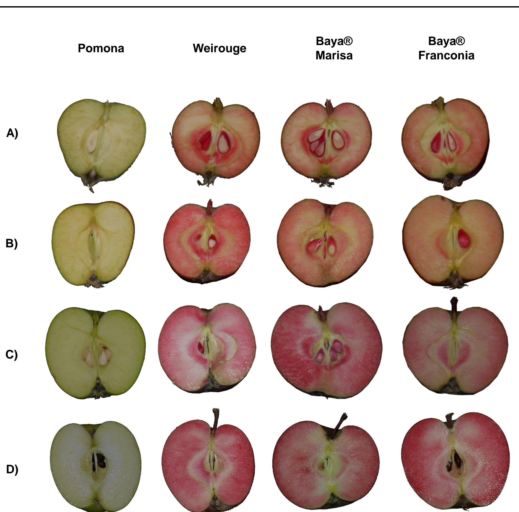
Fig 1. Fruit developmental stages of 'Pomona', 'Weirouge', 'Baya® Marisa' and 'Baya® Franconia'. (A) first harvest at 07.06; (B) second harvest at 27.06; (C) third harvest at 25.07 and (D) fourth harvest at 28.08.2018.