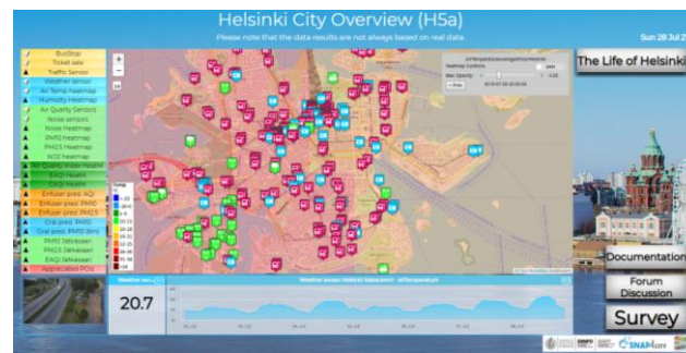
Figure 3. City of Helsinki dashboard

The Snap4city platform is currently used in many cities and regions. The Snap4city APIs allow accessing all this information from different applications. Some mobile applications have been developed (e.g. Helsinki in a Snap, Antwerp in a Snap and Tuscany in a Snap) to leverage all these geographically annotated information and provide useful services to the citizens or tourists on the move from their mobile phones (find services nearby, time tables, heatmaps of pollution or weather conditions, etc.).